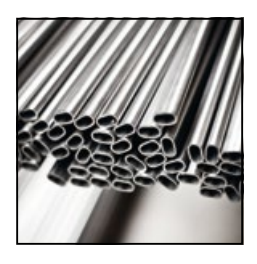
Environmentally friendly shine. At Sedus, perfect

You will find more information at www.sedus.com/en/ecology